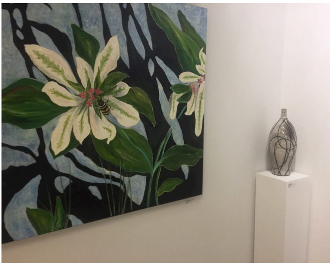
Celebrating the art of pairing and juxtaposition.