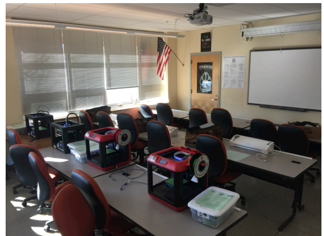
3D printers and cutters ready for use and adoption!