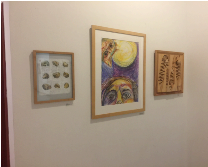
Artwork representing a variety of media and processes