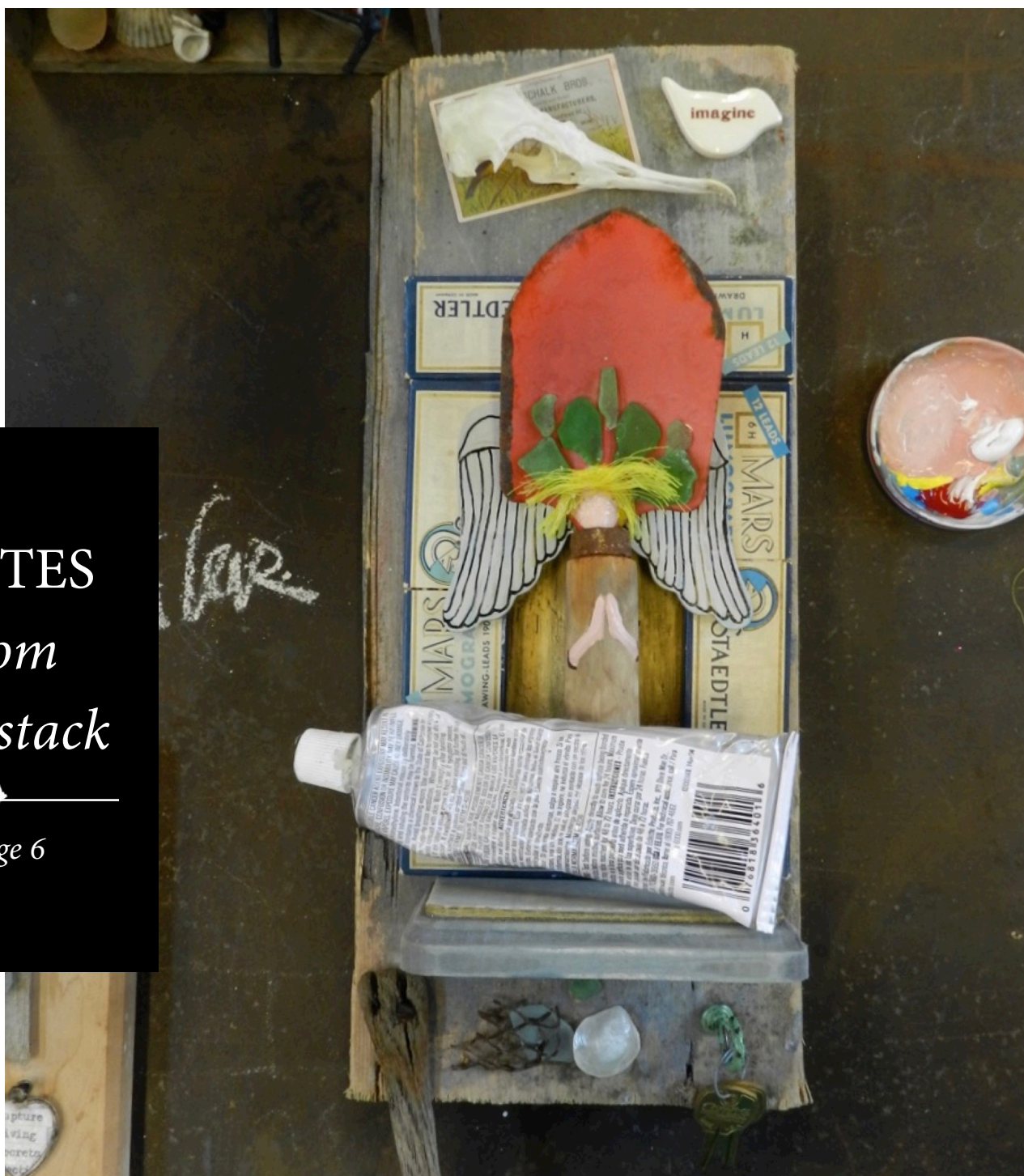
Artwork created during the MAEA Fall Conference at Haystack