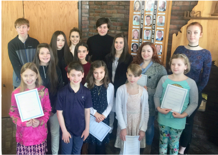
On March 4 th students were presented with certificates at the MEA offices in Augusta on in celebration of their beautiful artwork. The work was matted and framed by the MEA (underwritten by Horace Mann) and will be on display there until next fall.