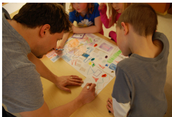
Third Graders and Families work together to create art, worry dolls, dance, Nascar racing and library time during Unified Arts Night at SeDoMoCha!