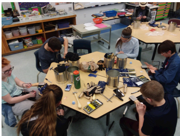
Students can even attend an after school metals program to continue learning about art processes.