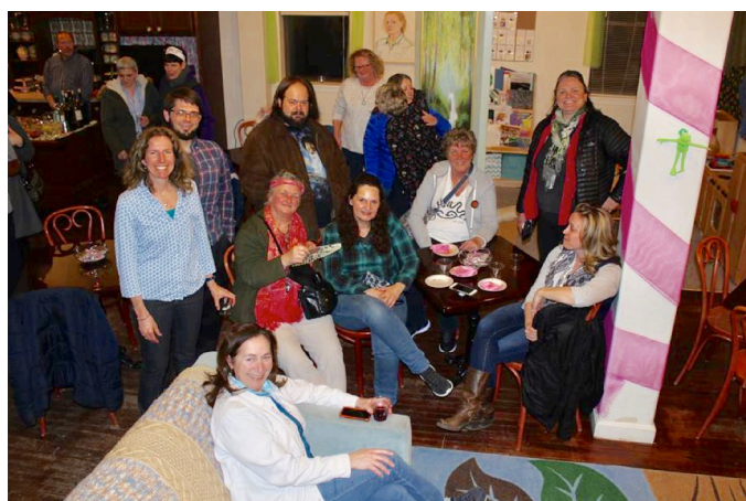
Art teachers from all around Maine gathered at the Wintergreen Arts Center for a pre-conference get-together.