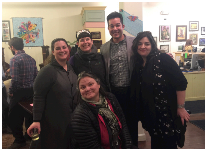
Conference attendees received a warm welcome to the County...