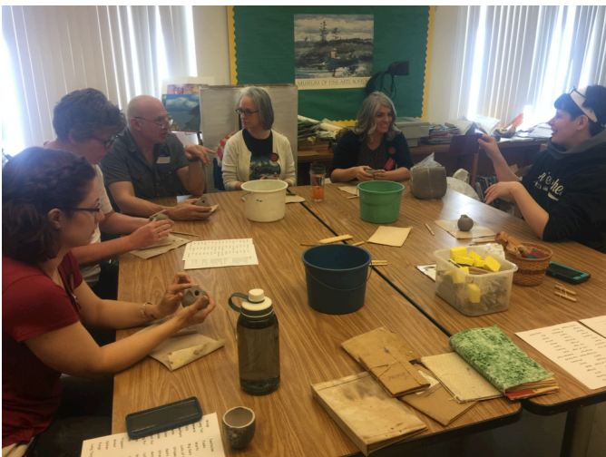
Creating clay whistles.