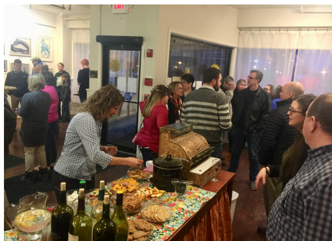
...and were greeted with food, wine, and the artwork of our northern colleagues.