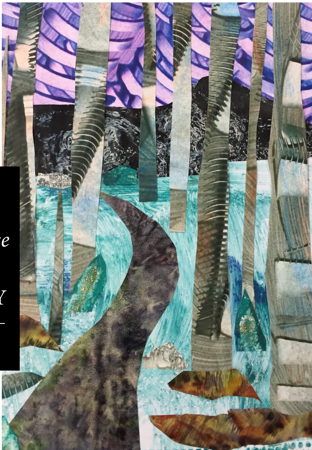
Painted paper collage by Kay Allison, created in Sue Beaulier's Spring Conference workshop.