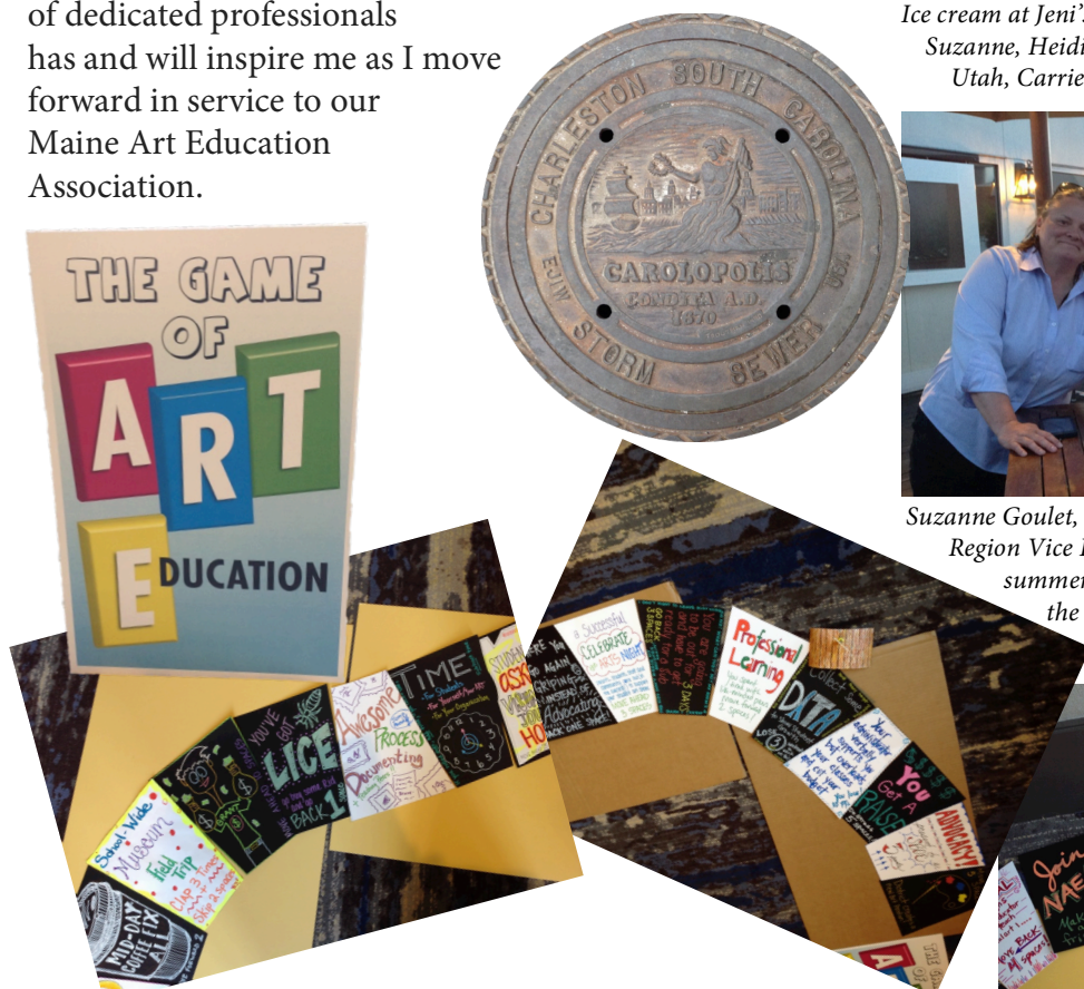
Blick Art Materials led an art/game-making activity on day one. The trials and tribulations of being an art educator were on display with our attendee created game board.