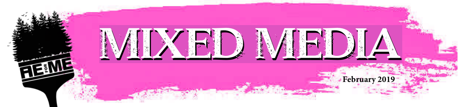
A publication of the Maine ART Education Association