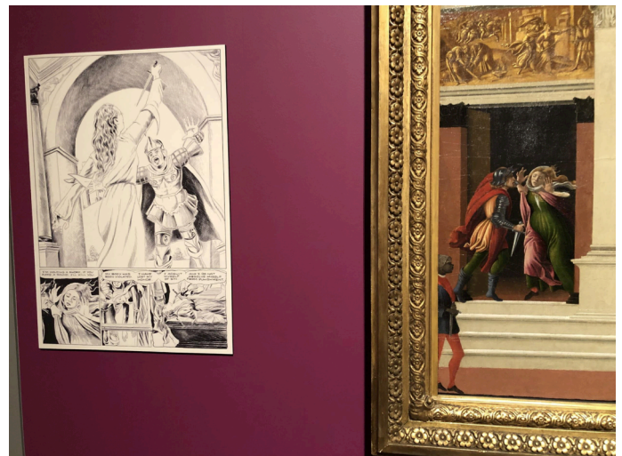
Boticelli exhibit at the Isabella Stewart Gardner Museum, Boston.