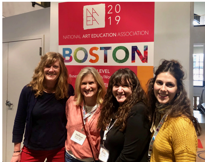
Portland Elementary Art Teachers.