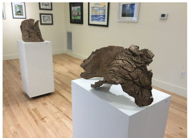
Bobbi Tardif's ceramic pieces. (Yes, ceramic!)