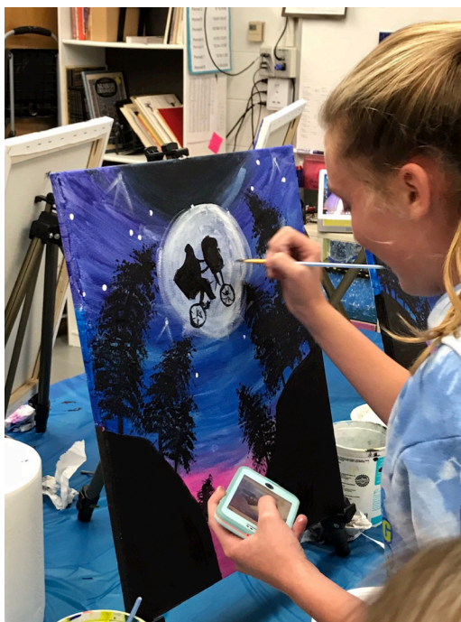
Creative interpretation encouraged

Portland Pottery, and used underglazes to decorate (we had recently had a bunch donated). Participants chose either a plate or a mug, and were also given a free ornament to decorate. We then had to glaze and fire all the pieces, but this was incredibly popular, and will definitely be an annual tradition.