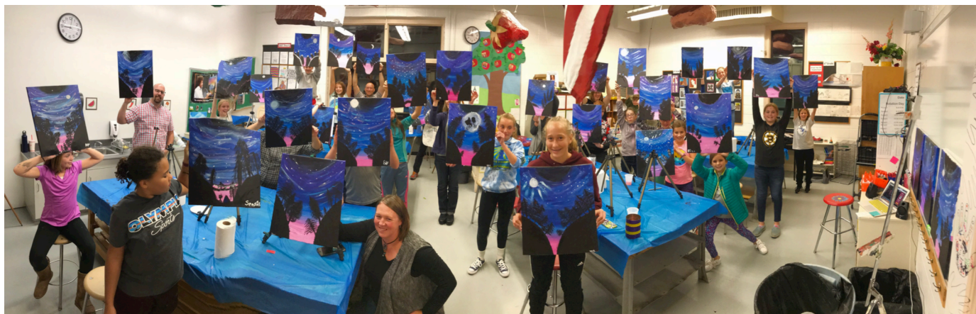
Showing off the final paintings