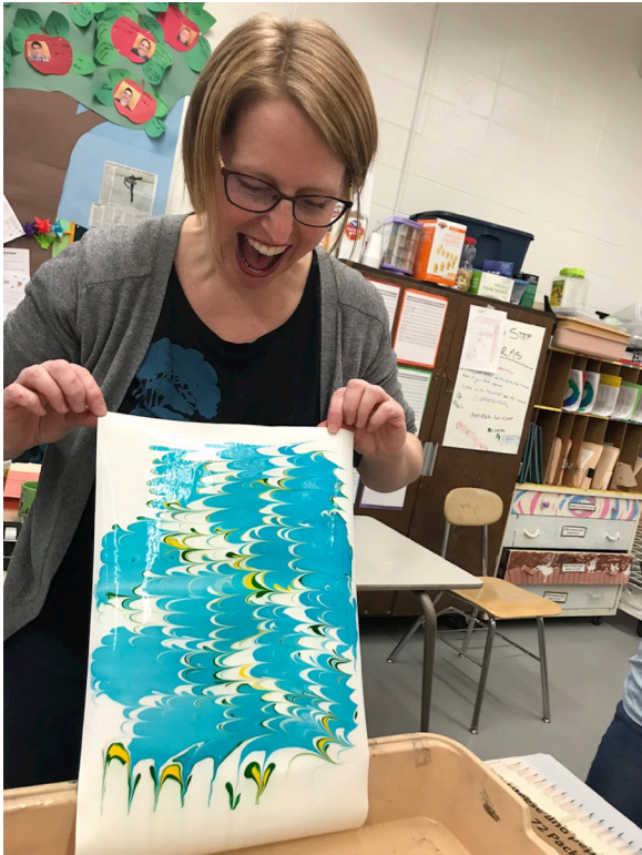
Every paper was an exciting experiment!