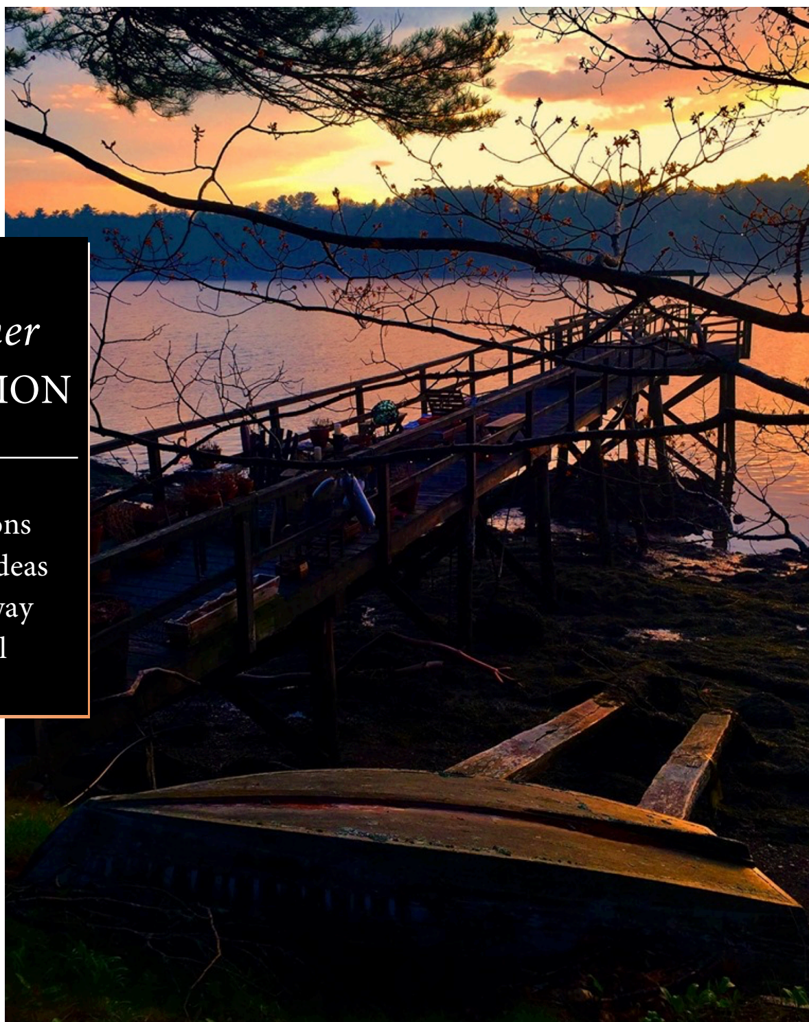
"Glow on the Sheepscot"

Reflections & Great Ideas to file away for Fall