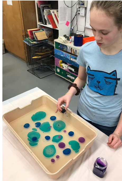
The technique was incredibly engaging.