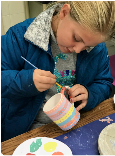
Artists follow where their inspiration.