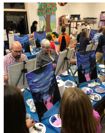
Quality family time