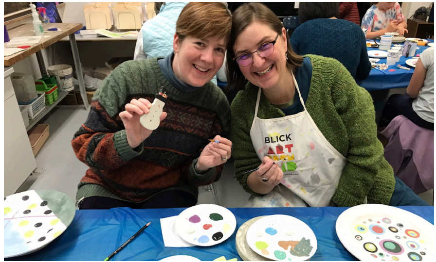
Two of our regulars: These friends have come to every night we've hosted.