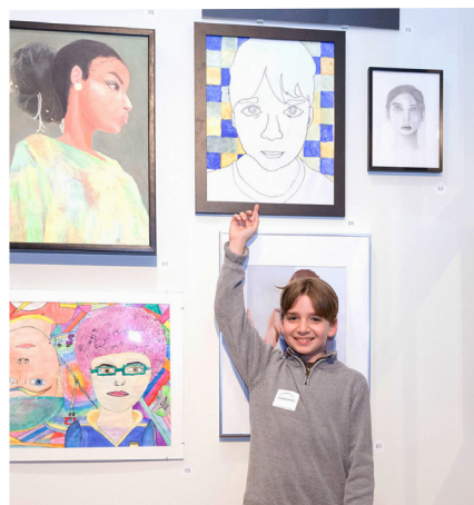
Young artist celebrated at a past exhibition