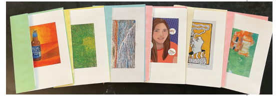
The artists' works were made into note cards and presented to them at the celebration

Work is submitted in November, prepared in the New Year, hung in February, opened in March, and celebrated through November. Numerous MEA staff, Maine educators, and legislatures view and celebrate the work during this time.