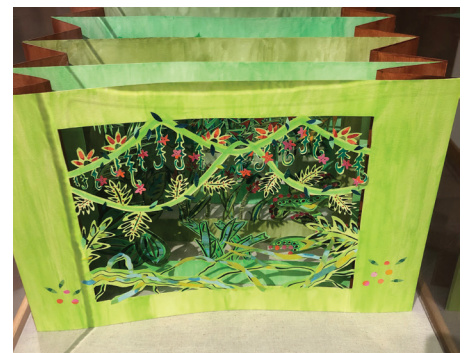
Intricate book art on display at the Atrium Gallery