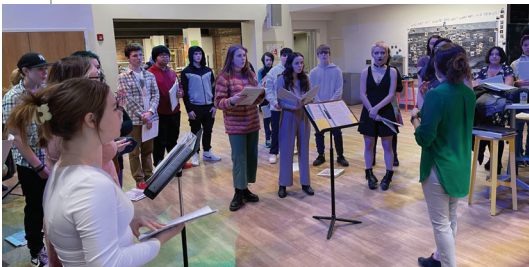
The Waterville SHS Chorus performed at the ceremony