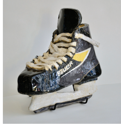
"El patin" by Cheverus senior Jake Scheele

Each artist who attended received a round of applause and a certificate on the big stage. It was a wonderful celebration of all the incredible art programs across the state that wouldn't be possible without the efforts of MAEA educators. The show can be viewed in person until April 3rd and online until 2024 at www.portlandmuseum.org/magazine/youthartmonth .