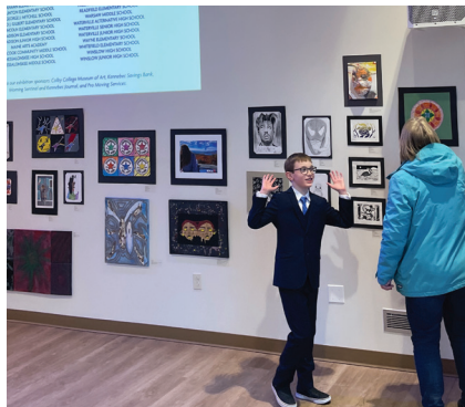
A young artist discusses his work at the YAM event at Waterville Creates!

evening attire. "Excuse me, you look like one of the artists?", I asked. The family hesitated, stopped and proudly responded physically and verbally with, "Yes." I inquired which location he was featured in and expressed my thanks for sharing his work. I later observed him with other older adults talking through his process and composition. What we did for the last two years to help keep each other safe for this moment to happen... made it all worthwhile and more!