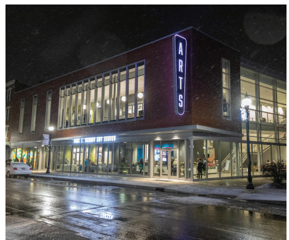
93 Main Street, Waterville, Maine 04901