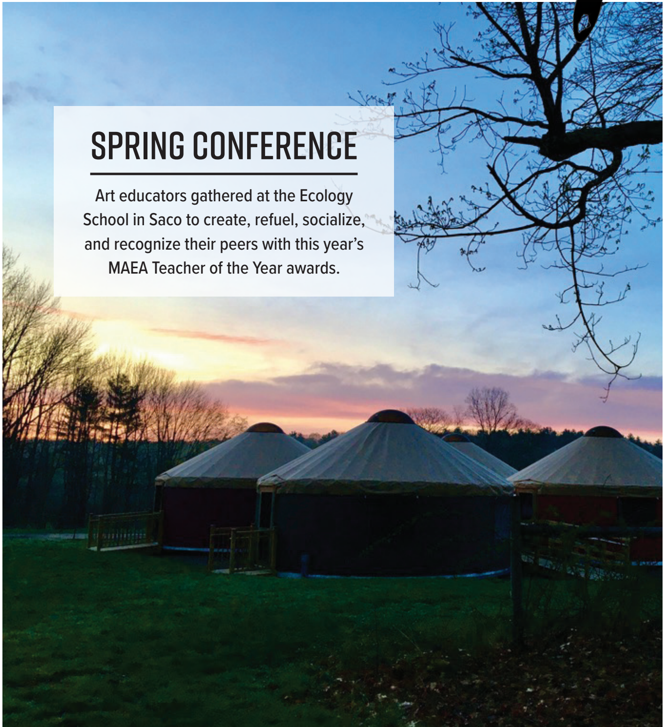
Yurts at the Ecology School at River Bend Farm in Saco, Maine

Art educators gathered at the Ecology School in Saco to create, refuel, socialize, and recognize their peers with this year's MAEA Teacher of the Year awards.