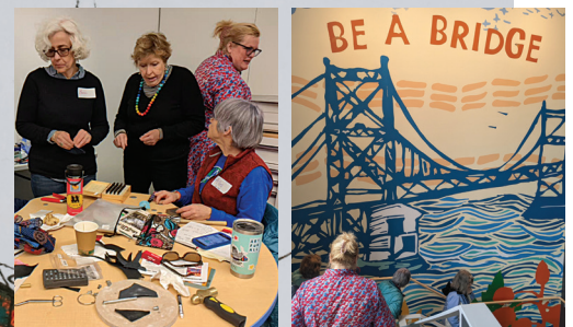
Art educators gather at Waterville Creates